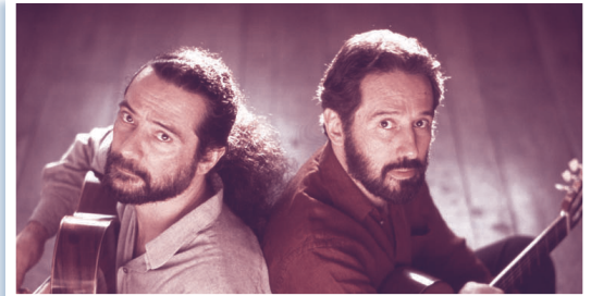
The Assad Brothers, Grammy winning guitar duo

All events will take place at Holsclaw Hall, School of Music