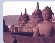
Shruti Bala Indonesia